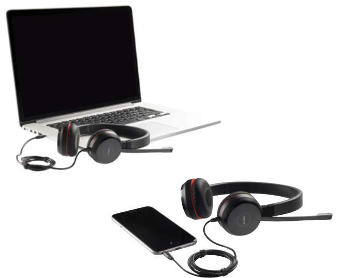
Jabra Evolve 40

USB adapter with 3.5 mm jack integrated into the control unit allows you to easily connect your headset to your PC, smartphone and tablet 2