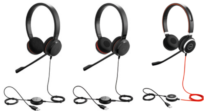
Jabra Evolve 20